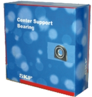
SKF Packaging for Center Support Bearing

Application: Part No. VKQA 81000 Vehicle details Tata Motors CVs