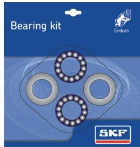
SKF Packaging for Bearing Kit