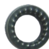
Now in Solid cage