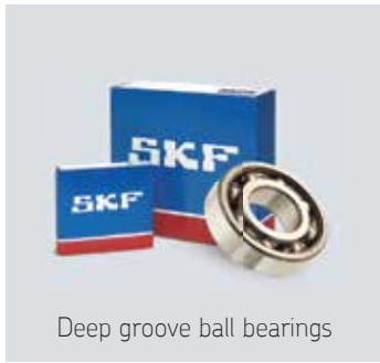
Deep groove ball bearings