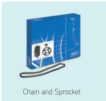
Chain and Sprocket