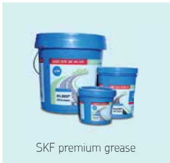
SKF premium grease