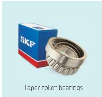
Taper roller bearings