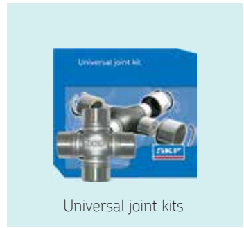
Universal joint kits