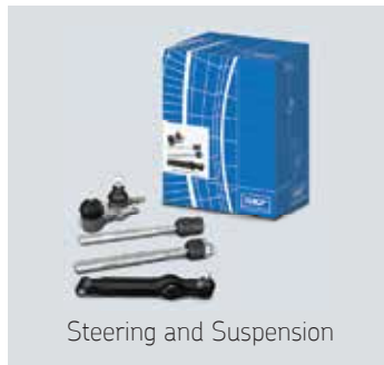
Steering and Suspension