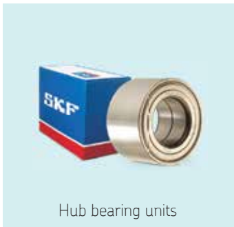
Hub bearing units