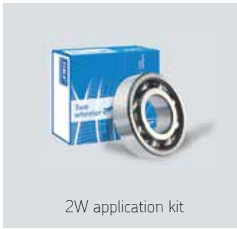
2W application kit